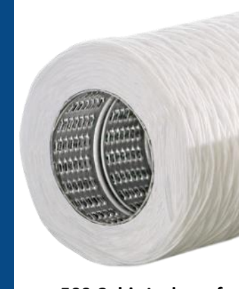
500 Cubic Inches of Depth Filtration.